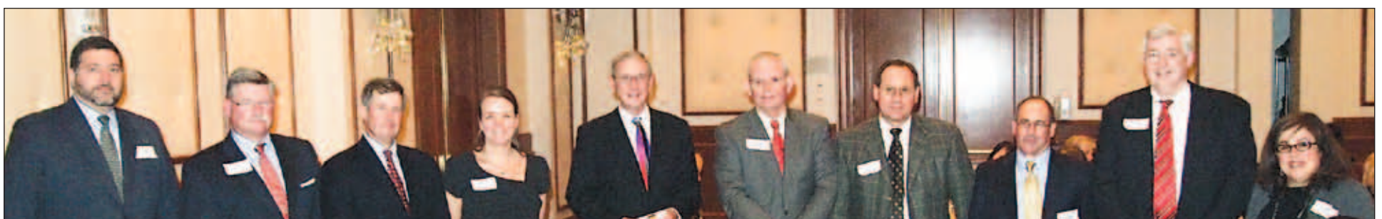
The 2011 Indianapolis Bar Foundation Class of Senior Fellows was honored at the luncheon for their contributions to the Foundation.