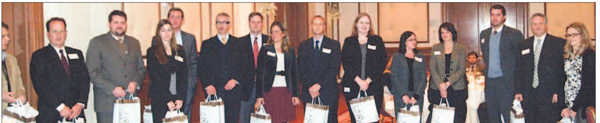
The 2011 Indianapolis Bar Foundation Class of Distinguished Fellows was recognized at the 2011 Recognition Luncheon.