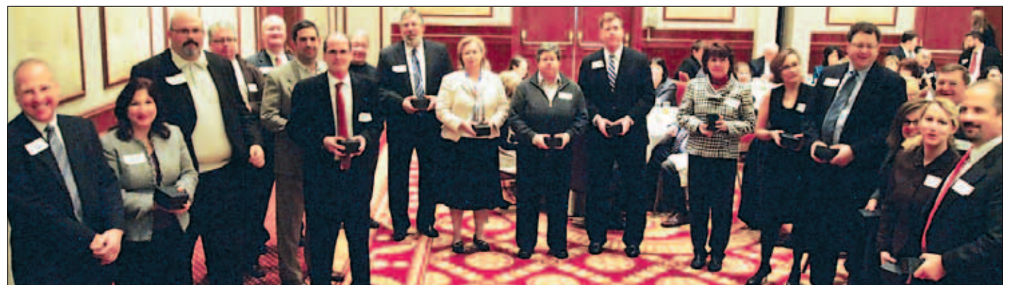
Attorneys who have practiced for 25 years were honored at the IndyBar 2011 Recognition Luncheon, held Tuesday, November 29th at the Conrad Indianapolis.