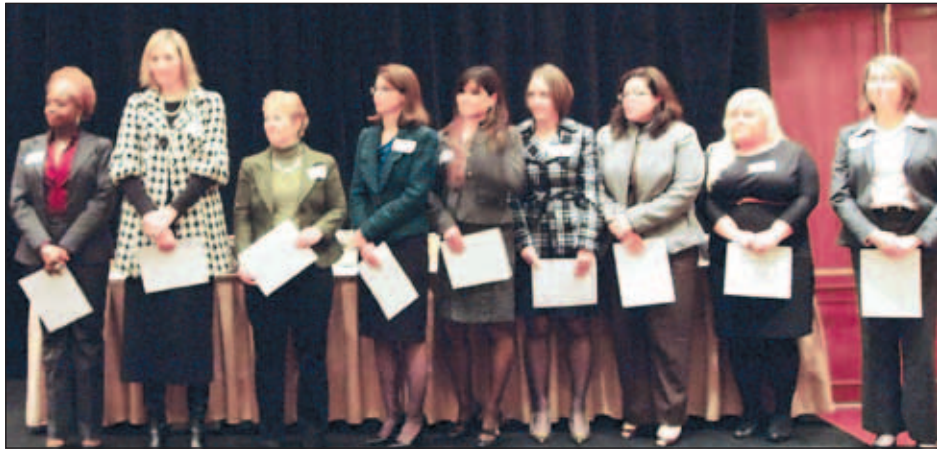
The IndyBar Women & the Law Division received the Dr. John Morton Finney Award for Excellence in Legal Education for their outstanding effort in presenting their first Women & the Law Division Symposium.